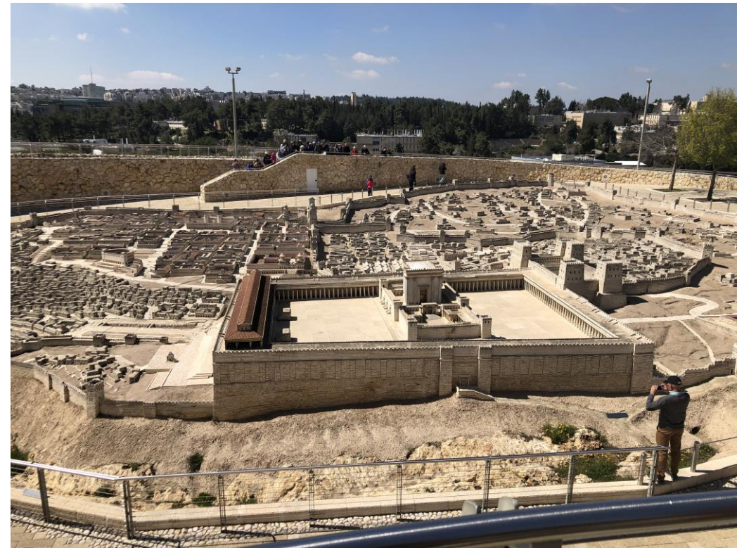
Replica of 1 st Century Jerusalem