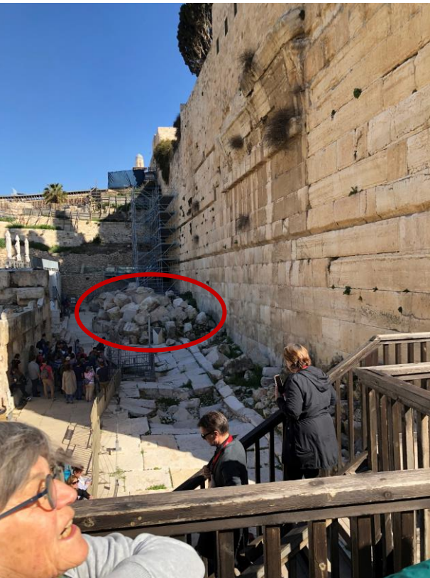
Stones from 1 st Century Temple Mount